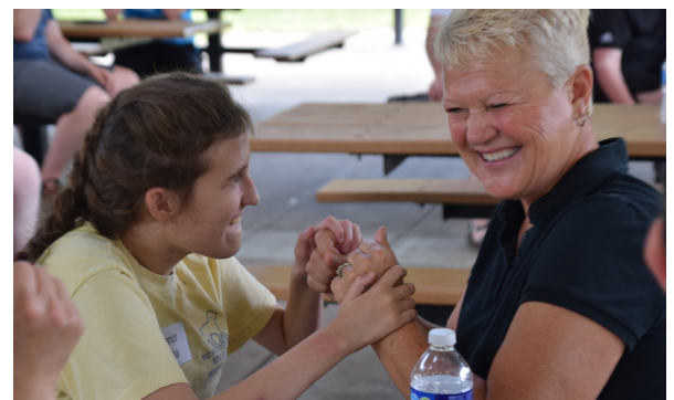
Access provided for all! Tactile American Sign Language shown here.