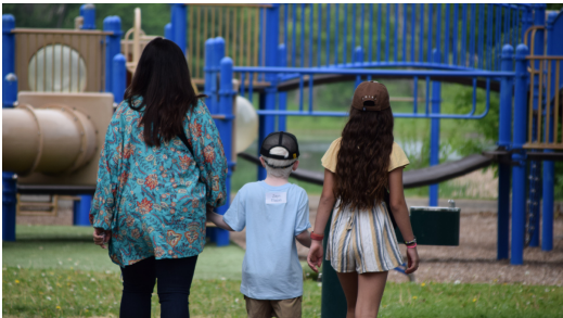
Family time together