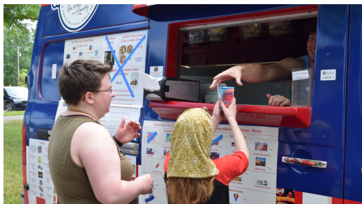
Ice Cream Truck