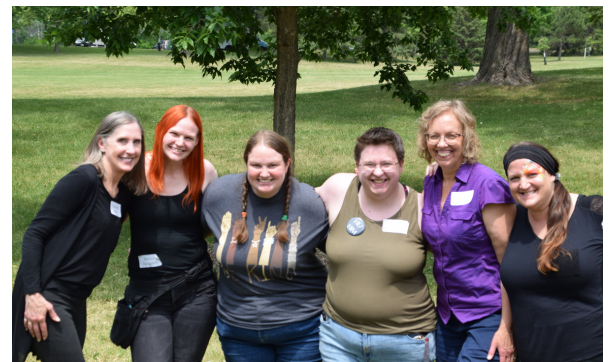
Amazing group of community interveners with DeafBlind Services MN (DBSM)